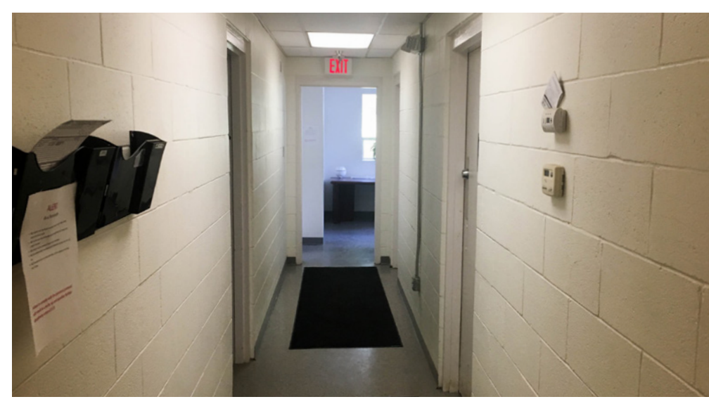
Building 1, office