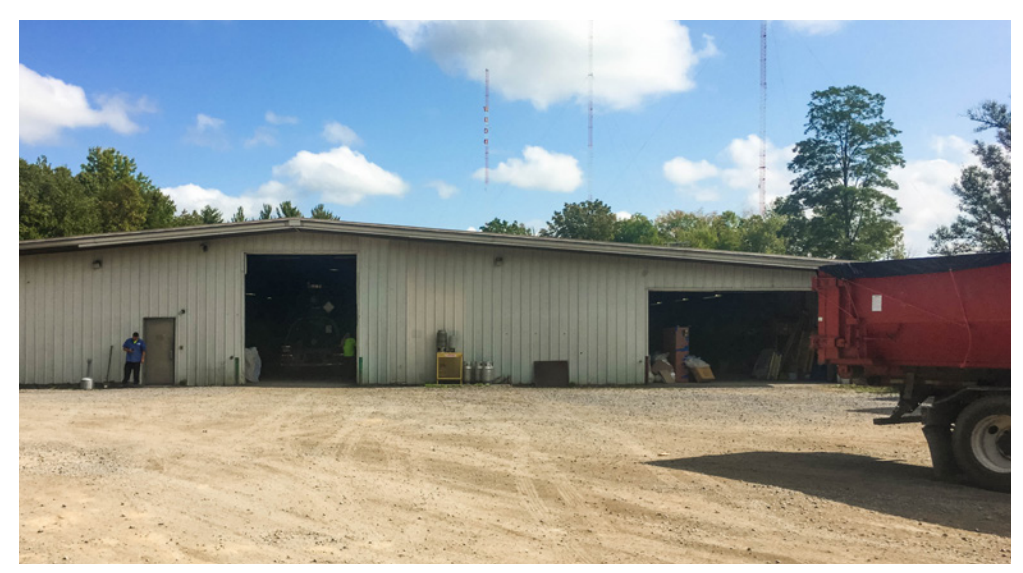
Building 1, rear